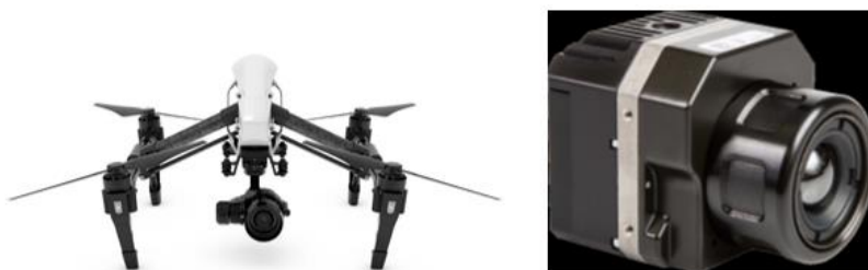
Figure 2- Aircraft (Inspire 1 Pro) and thermal camera (FLIR Vue Pro) utilized in this study.

The UAV-borne thermal imaging in this study was conducted by a consultant specializing in aerial photography, videography and thermography who has completed UAV training, IRT training, pilot licensing, and acquired special risk aviation insurance and gained a special flight operation certificate as per the requirements of the Canadian Aviation Regulations. The setup of both the drone and the thermal camera was firstly completed by the UAV operator. This includes the installation of the propellers and downloading the drone and camera operating software. The DGI Go app controls the flight and allows for a real-time view of a live video to line up the perfect shot where the data is automatically saved on the used mobile device. The FLIR Vue Pro app allows the setup of image format, orientation, shutter speed, camera focus adjustment, shooting mode, and color palette and communication options with the mobile device. All the batteries were recharged and the camera was mounted on the drone and oriented facing straight-down to be perpendicular to the concrete deck surface being investigated. It was not possible to measure the angle while flying. Hence, an estimation of the drone’s perpendicular position to the deck surface was made from the live stream video of the flight displayed in real-time on the monitor. Figure 2 illustrates the utilized drone and thermal camera.