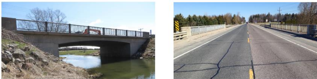
Figure 1 -East elevation of the surveyed concrete bridge (2) and an overview of the deck condition.

The UAV-borne thermal survey for this study was conducted onsite in a real-world application on two in-service RC bridge decks located in the city of London, Ontario. The bridges were scheduled, by the Ministry of Transportation Ontario (MTO) for rehabilitation because delaminations, the extent of corrosion and high chloride ions content in the bridges were recently identified by a condition survey. Thus, the bridges were considered as good candidates and selected for the UAV survey. The two bridges, (named herein bridge (1) and bridge (2)) were constructed in 1965 as single span cast-in-place RC frames passing over a creek. The frames are supported directly on the abutments, and paved with about 100 mm (4 in.) asphalt wearing surface, as indicated in the structural drawings. The bridge structures have a north-south orientation and their outer limits have concrete curbs and steel handrails. The critical deck characteristics include a total length of 15.24 m (50 ft.) with a transverse width of 12.18 m (40 ft.), which supports one lane of traffic with one side shoulder in each direction. The structural drawings of both bridges indicate a deck slab thickness varying from 0.91 m (3 ft.) at the abutments to 0.48 m (1.6 ft.) at the mid-span of the deck with a parabolic soffit. Figure 1 illustrates the surveyed bridge (2) and a view of the condition of its deck. The utilized drone, thermal camera and the data collection methodology are briefly discussed below.