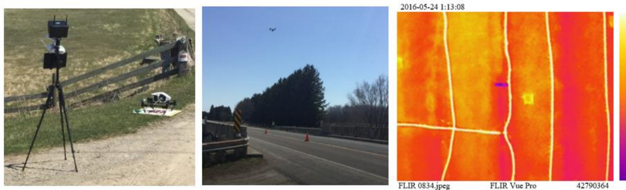
Figure 3 -Setup of UAV-borne thermal system and a snapshot during flight over bridge (2).