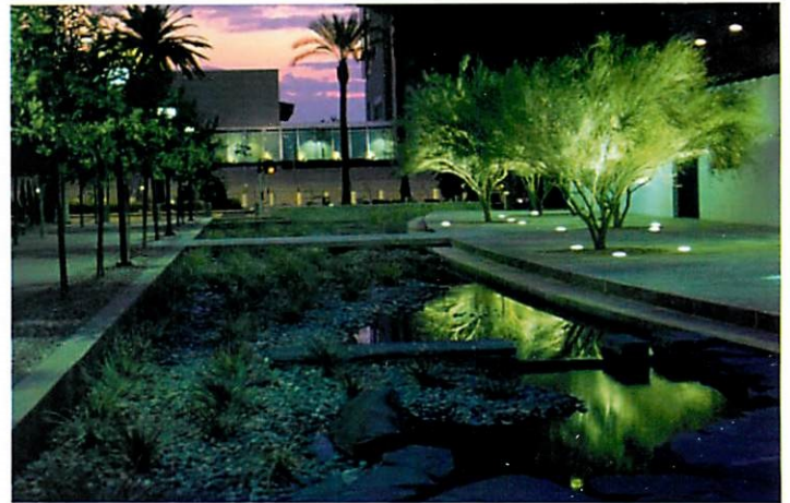
2004 Public Facility Award Winner

Your entry is submitted to a panel of judges whose only opportunity to evaluate your project is through the pictures and narrative that you submit. Pictures of the project throughout the entire construction process are preferred. Include pictures that show difficult or unusual placement, unique forming or special finishes. For the entry to present well, it is crucial that full consideration be given to lighting and composition of your photographs. Sometimes a project will show better in an evening picture that one taken during the day. Remember to include pictures of the completed project.