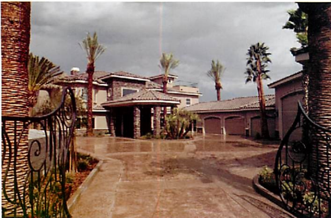
2004 Judges Choice Award Winner

Please provide between 10 and 25 digital pictures of the project in JPEG format (minimum resolution of 640x480) submitted on a CD or memory stick. Please no zip files. Pictures should be numbered or captioned and included in your project narrative. A photographer's release form must accompany all submittal packages. Please keep all pictures free of company logos, names, and date stamps.