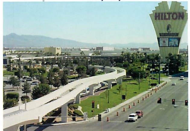
~ 2004 Major Project Award Winner