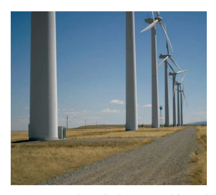
Fig. 3.1.1a—Typical row of turbines in a wind farm and their access road, Arlington, WY.

3.1.1 Wind farm development —A wind farm consists of several wind turbines distributed over a large area (Fig. 3.1.1a). Because the visual impact and land requirements are significant, the development of a wind farm is complex and often requires considerable public input. Figure 3.1.1b presents