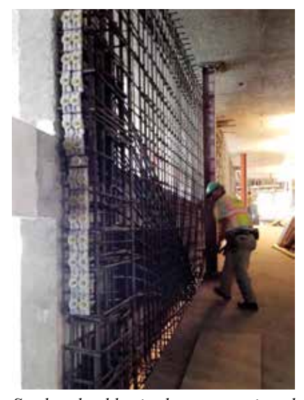
Steel and cables in the post-tensioned beam