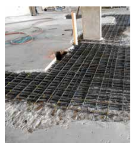
Fourth-level transfer slab crack repair after demolition

On June 24, 2010, the resident manager who lived on the fourth floor observed the walls within her unit were buckling and the tile floors were cracking. She immediately contacted a structural engineer, who confirmed a major failure and incipient collapse and arranged for a contractor to immediately install emergency shoring. By the time shoring was installed, the crack spanned four column bays and in some areas the concrete floor had lifted as much as 4 in. (102 mm). The building was evacuated.