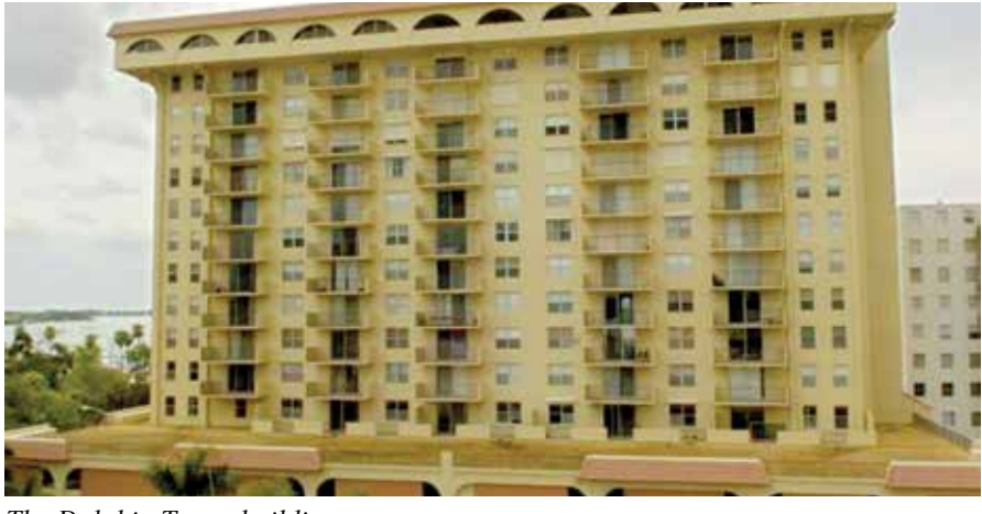
The Dolphin Tower building

The Dolphin Tower project was very challenging and used many interesting and groundbreaking design concepts. Constant communication between the contractor, design engineer, and owner was a necessity to adapt to continuously changing conditions, which required quick solutions to maintain the aggressive schedule. Despite many challenges, the repairs were completed on schedule and under budget.