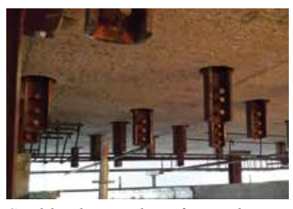
Steel lug keys and reinforcing bars in the drop panels