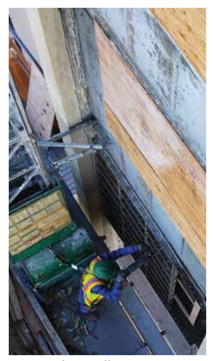
Exterior shear walls

cost savings. The design evolved from removal and replacement of the fourth-floor slab and installation of exterior shear walls to installation of post-tensioned drop panels combined with a structural overlay and interior shear walls. This ultimately resulted in a cost reduction of more than $500,000 at the end of the project, and completion of the $9 million structural repair on time.