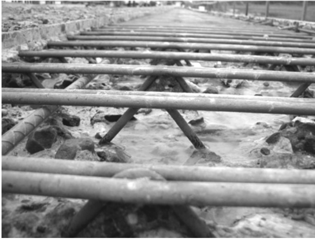
Fig. 3—Reinforcing steel and bar joist top chords exposed using hydrodemolition.