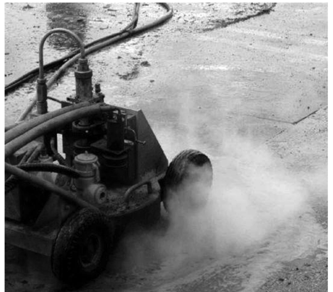
Fig. 6—Hydrodemolition mower.

Hydrodemolition equipment consists of high-pressure pumps (Fig. 4); self-propelled robotic units to hold and maneuver the water jet (Fig. 5); small push or self-propelled units (mowers) used for small removal areas (Fig. 6); and hand lances (Fig. 7). The robotic units move the water jet uniformly over the surface. Where the concrete quality is consistent, the removal will be uniform and result in a finished surface profile amplitude approximately the size of the coarse aggregate. Travel speed of the unit can be adjusted to control the overall amount and depth of removal. The