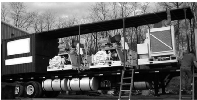
Fig. 4—Hydrodemolition pump trailer.

movement or de-tensioning of the tendons. Sudden release of anchorages or removal of support for the tendon profile could lead to equipment damage, personal injury, or structural integrity loss. Refer to International Concrete Repair Institute's (ICRI's) ICRI Technical Guideline No. 310.3, "Guide for the Preparation of Concrete Surfaces Using Hydrodemolition Methods," for additional information regarding considerations for hydrodemolition use.