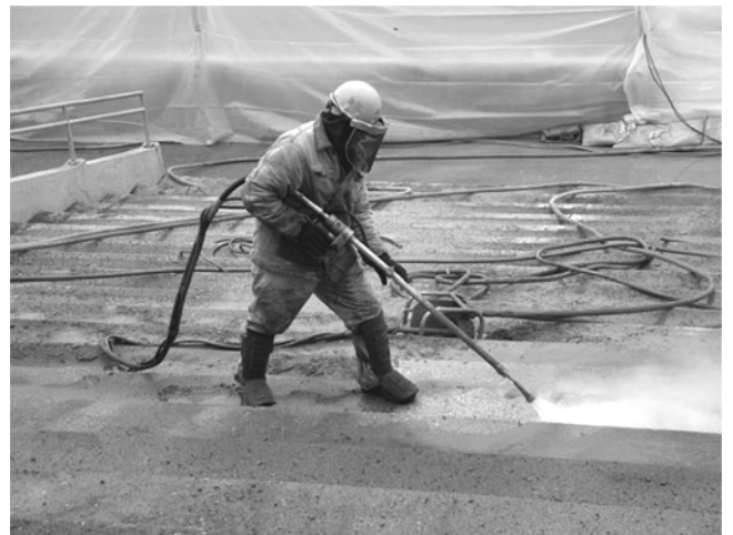
Fig. 7—Hand lance for hand-held hydrodemolition