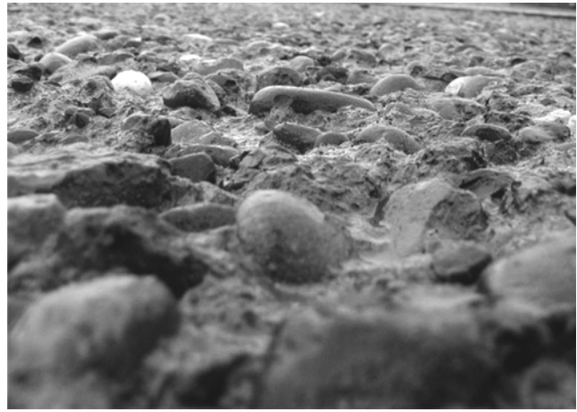
Fig. 1—Surface profile after hydrodemolition.

Hydrodemolition is particularly effective in removing concrete from around embedded metal elements such as reinforcing steel, anchors, and pipe conduits (Fig. 2). Embedded metal elements may block the water jet from removing the concrete directly beneath the element, leaving a concrete shadow. If the concrete removal depth is sufficient, however, the angle of the water jet will undercut the metal element and remove the shadow. Otherwise, the shadow may be removed using a hydrodemolition hand lance or chipping hammers.