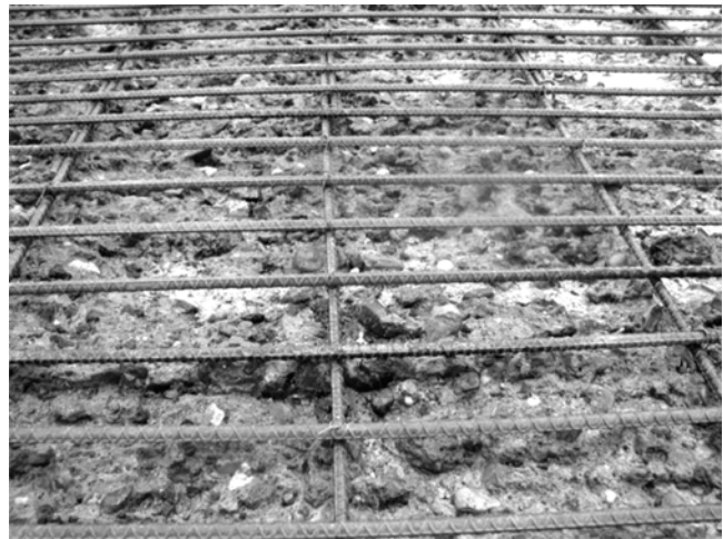
Fig. 2—Reinforcing steel exposed using hydrodemolition.

Impact removal techniques can bruise the surface, creating a fractured layer typically extending 1/8 to 3/8 in. (3 to 10 mm) deep and frequently results in lower bond strengths compared to surfaces prepared with nonimpact methods. Where impact removal techniques such as jack-hammers, rotomilling, or similar methods are used, hydrodemolition may be used to perform final concrete removal and surface preparation to remove resulting microcracking. High-pressure water jetting may also be used to remove corrosion products from reinforcing steel (Fig. 3).