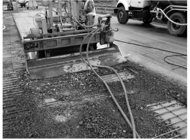
Fig. 5—Hydrodemolition robot.