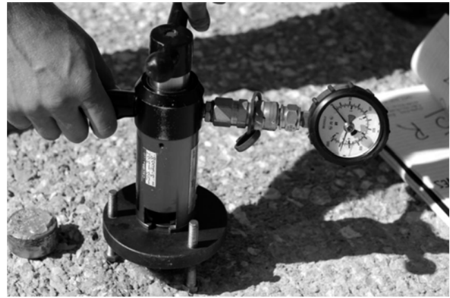
Fig. 8—Tensile bond test on prepared substrate.

All high-pressure equipment should be operated by individuals experienced in the use and maintenance of this specialized equipment. Hydrodemolition uses high-pressure water jets; the water jet is very dangerous and can cause