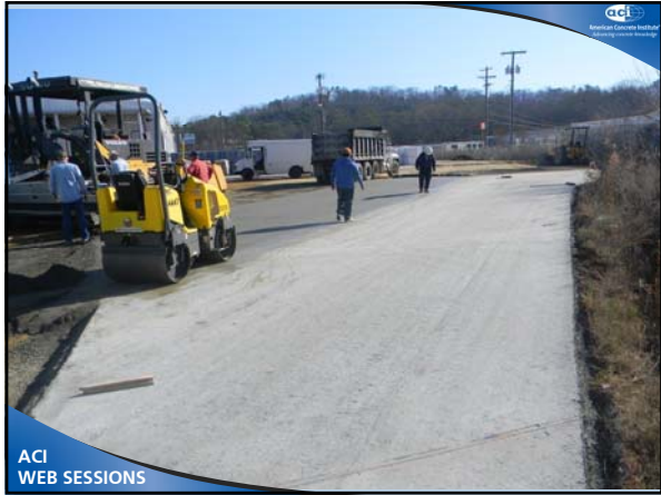
ACI WEB SESSIONS

How many cubic yards can be produced per day? That depends. The largest job we have done is 700 cubic yards in nine hours. The smallest was 50 yards.