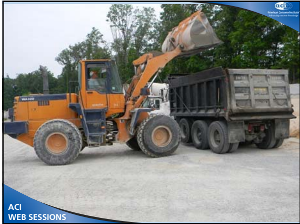
ACI WEB SESSIONS