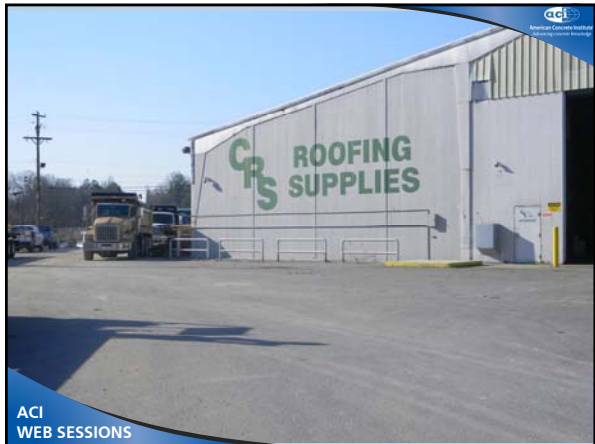
ACI WEB SESSIONS