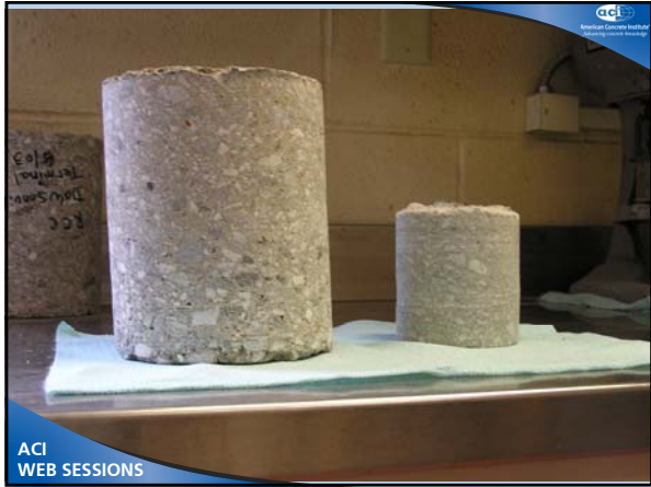
ACI WEB SESSIONS