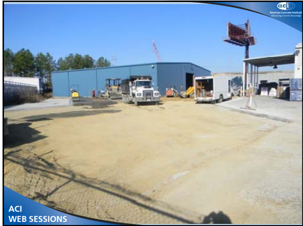
ACI WEB SESSIONS