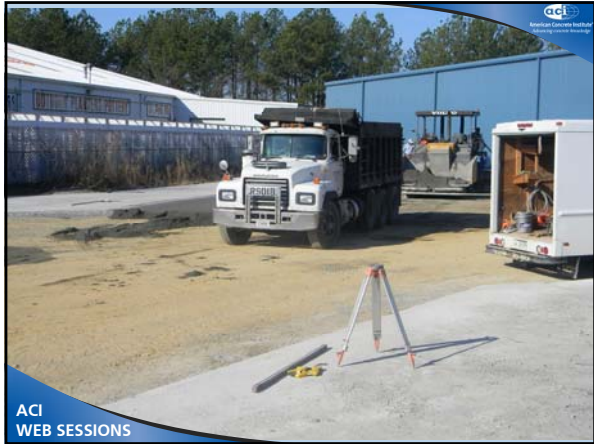
ACI WEB SESSIONS