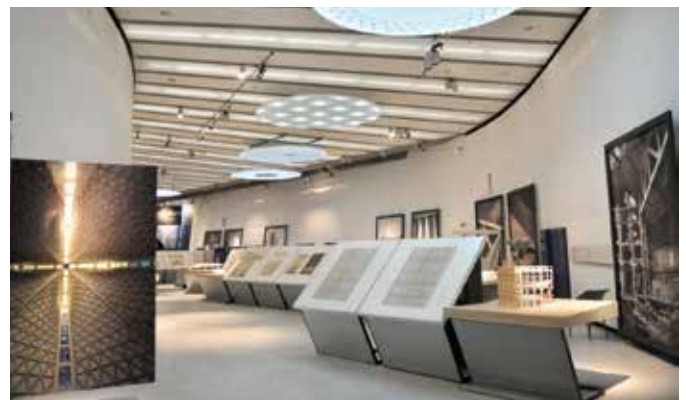
The original exhibition of “Pier Luigi Nervi – Architecture as Challenge” displayed at the MAXXI Museum in Rome, 2010-2011

Nervi was an Honorary Member of ACI, American Institute of Architects, American Academy and Institute of Arts and Letters, Royal Academy of Fine Arts Stockholm, American Academy of Arts and Sciences, International Institute of Arts and Letters of Zurich, International Association for Shell Structures, Royal Netherlands Society of Engineers, College of Architecture of Peru, Royal Academy of Arts, and Franklin Institute.