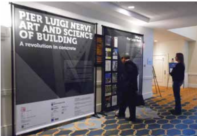
Two of the 20 display panels for “Pier Luigi Nervi – Art and Science of Building” Exhibition, in Philadelphia, PA

In 2015, a new, light version of the Exhibition, titled “Pier Luigi Nervi – Art and Science of Building,” was created for a more extended international and intercontinental tour. Presented by ComunicArch Associates in association with the