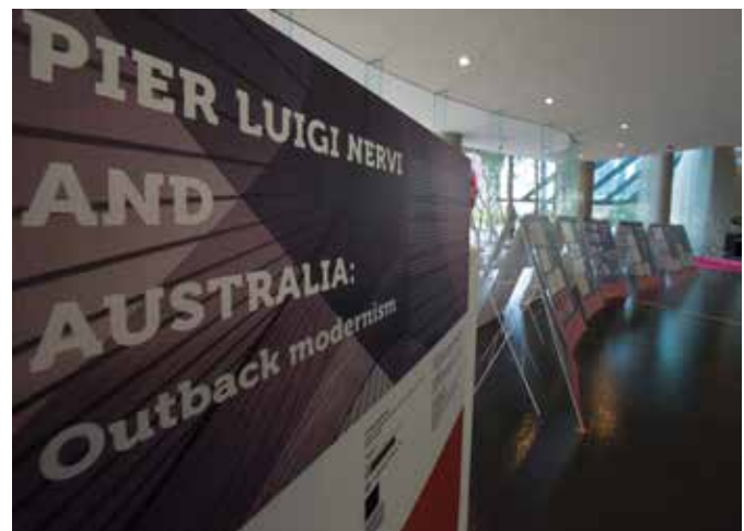
The Nervi Exhibition hosted by Curtin University in Perth, Australia, May-June 2017