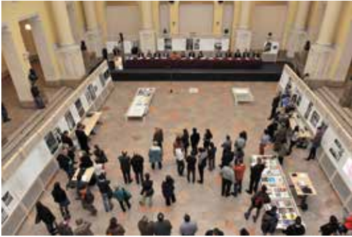
Opening of the Nervi Exhibition at the BME Budapest University of Technology and Economics, March 2016