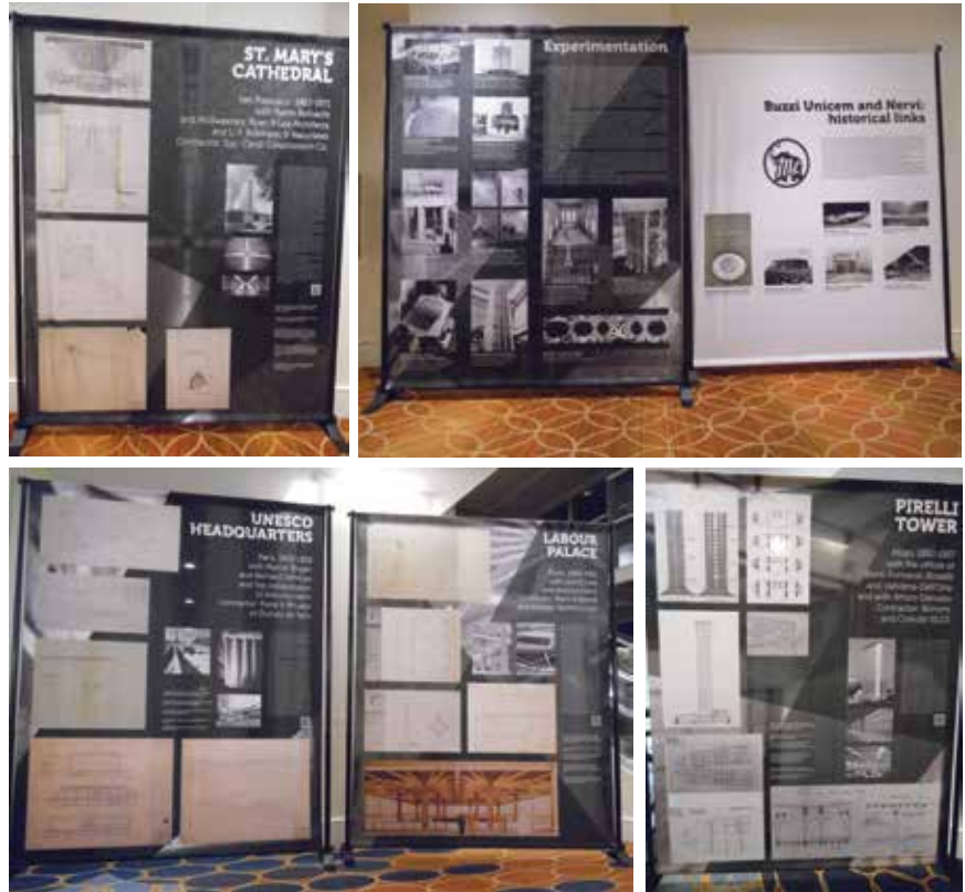
Display panels for the “Pier Luigi Nervi – Art and Science of Building” Exhibition included text, photographs, and photos