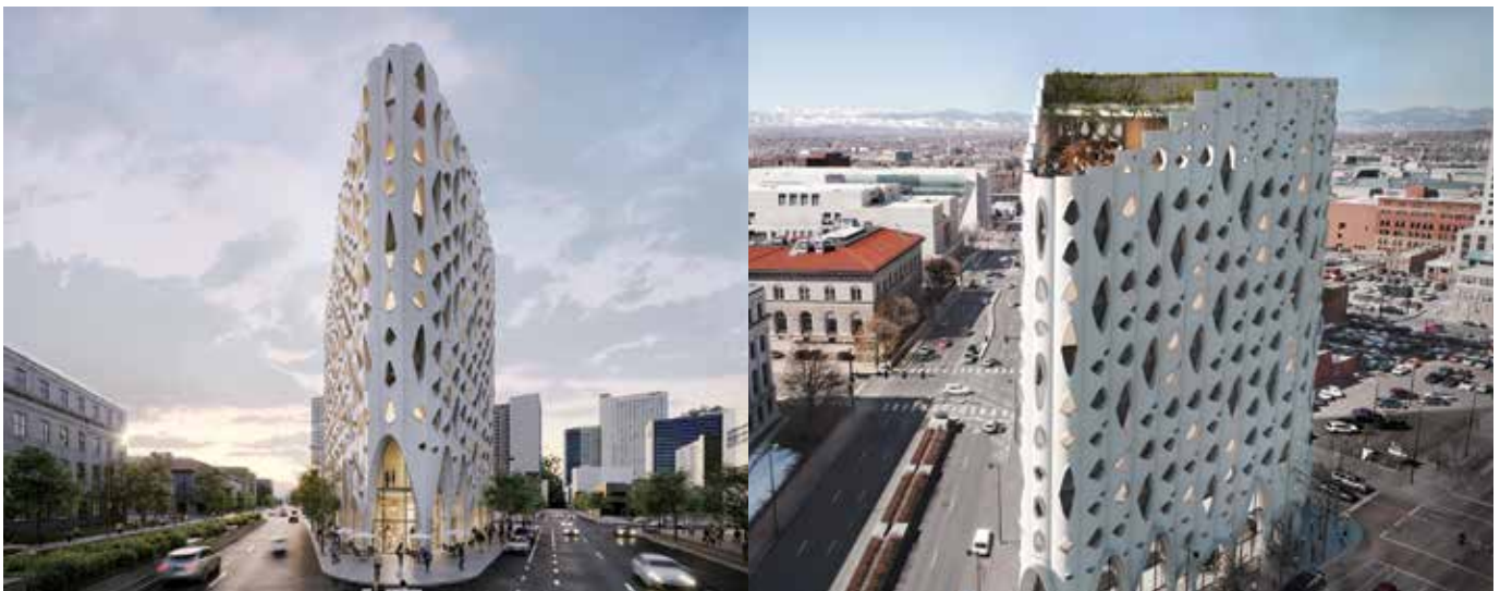
Fig. 1: Renderings of the Populus hotel

Unlimited Designs' Director of Project Management