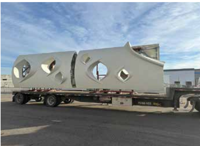
Fig. 5: Finished GFRP panels were transported on a truck from Salt Lake City, UT, to Denver, CO

The hotel's façade features 374 large panels.