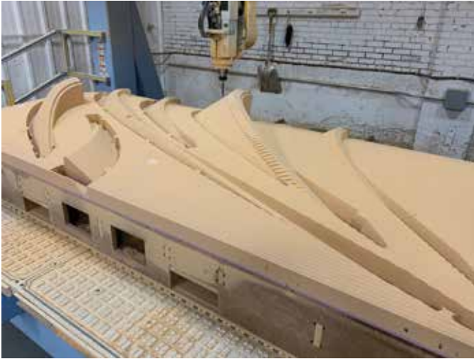
Fig. 3: Scalloped design features created in MDF