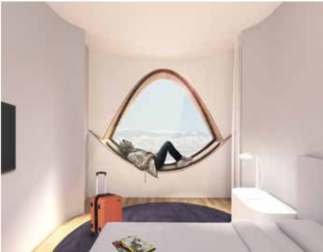
Fig. 4: A guest room with a parabolic window seat (image courtesy of Studio Gang)