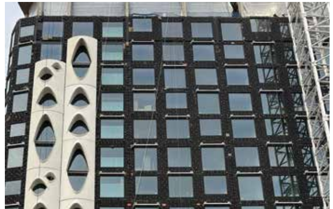
Fig. 6: The Populus hotel's façade during construction. The black areas are the weather wall's barrier membrane. The alternating metallic bands are high-strength galvanized steel "towel bars" for hanging the white GFRP panels

"The design intended to minimize connections to the primary structure and permit the GFRP to work to its strengths," O'Hara explained. The team achieved this by minimizing the number of anchors using the towel bar and wind load pins. Thus, there were only about six anchors per