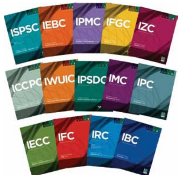
Fig. 1: ICC-developed model codes (refer to www.iccsafe.org )

In 2017, the ACI Board of Direction modified the ACI mission: “ACI develops, disseminates, and advances the adoption of its consensus-based knowledge on concrete and its uses.” The additional phrase (shown in bold text) was included to recognize that the general public is the ultimate beneficiary of most ACI committee work on standards and certification programs; and it encourages ACI members, as part of a professional society, to advocate for the use of those standards and programs for the benefit of society. Ideally, this is accomplished by having ACI standards and programs properly referenced in the building code. Because most building codes are based on model building codes, the most efficient method is to incorporate ACI standards and programs in the model codes developed by ICC.