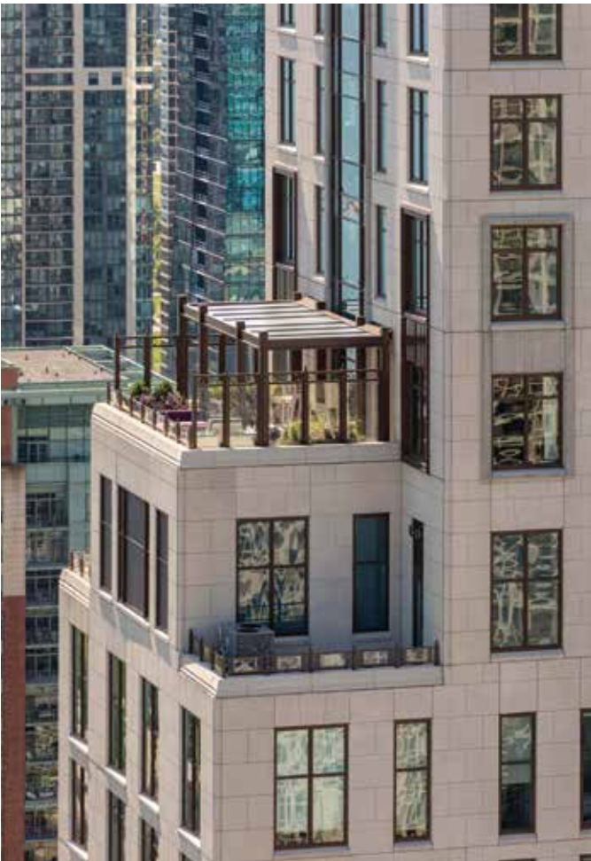
Fig. 4: Exterior metal railings and posts such as these on One Bennett Park, Chicago, IL, USA, can be used as strike termination devices

Braided or twisted multistrand cables are typically used as lightning conductors to interconnect air terminals and as down conductors to ground. Down conductors are spaced not more than 100 ft (30 m) around the building perimeter; a minimum of two down conductors are required for a building. Tall concrete structures also require intermediate-level conductor loops around their perimeters (Fig. 5).