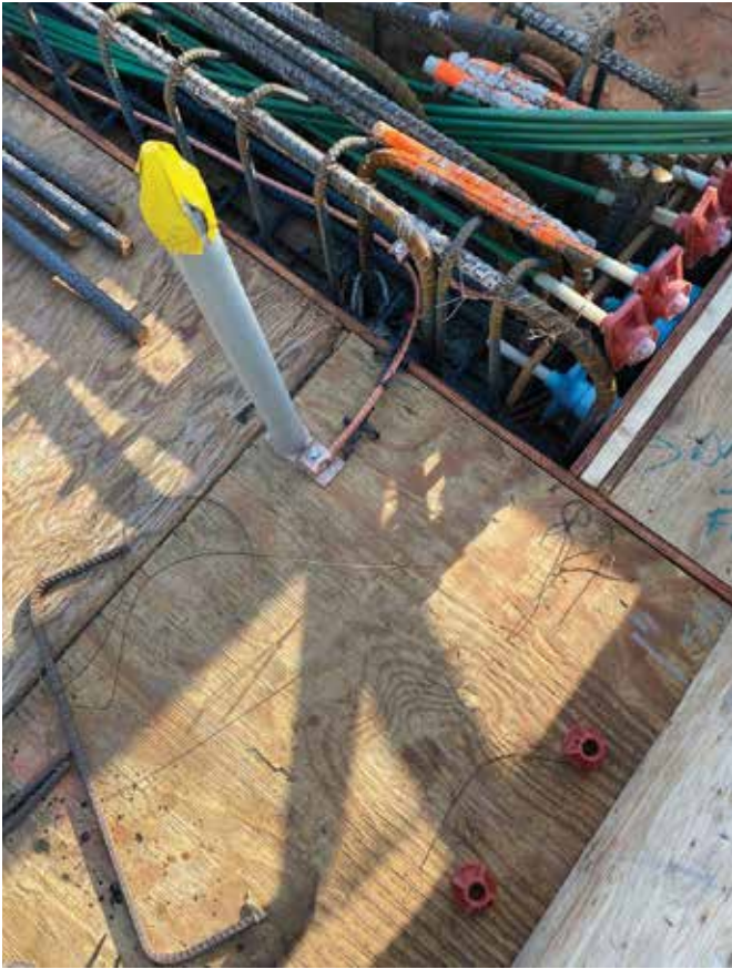
Fig. 6: A conduit will serve as part of a through-roof penetration device connecting lightning conductors on the roof to down conductors below

Conductors can be installed in direct contact with combustible materials and do not require thermal or electrical protection. Weather-resistant, through-structure penetration devices may be required where conductors pass through roofing or walls (Fig. 6). Copper lightning conductor cables can be embedded in concrete, pulled through conduits in the concrete, or mounted on concrete surfaces. Embedment conceals conductors to meet aesthetic considerations, and it provides a secure, permanent installation that is protected against damage and theft. However, the process of embedding conductors requires close coordination with the lightning protection installer and other subtrade contractors (Fig. 7).