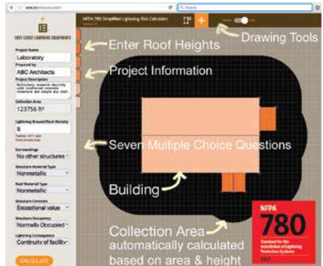
Fig. 2: Online apps are available for conducting lightning risk assessment in accordance with NFPA 780 protocols. The user sketches the building's horizontal projected area, enters the height of each roof area, and answers seven multiple-choice questions based upon information that is usually available early in the design process. The app calculates the building's vulnerability and risk and prepares a report indicating whether a lightning protection system is recommended (illustration courtesy of East Coast Lightning Equipment, Inc.)

Components are typically made of highly conductive copper, copper alloy, or aluminum, and they should be selected based on compatibility with adjacent materials. For example, copper cannot be in contact with steel or aluminum due to galvanic action, and aluminum should not be embedded in concrete due to its alkalinity.