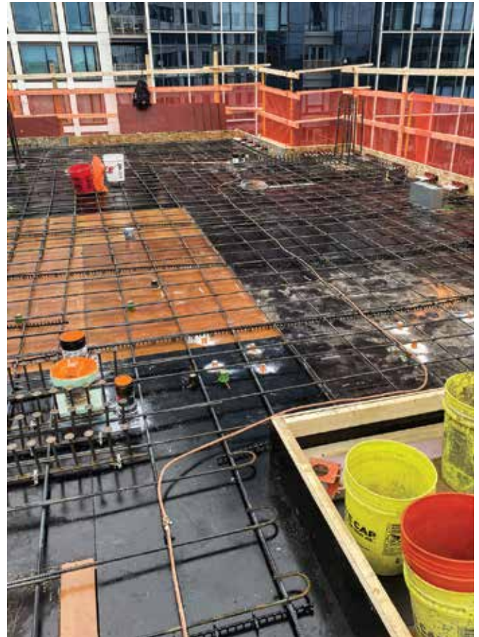
Fig. 5: To help equalize the electrical potential throughout the building, NFPA 780 requires that tall reinforced concrete structures include loop conductors, interconnected with down connectors, at vertical intervals not exceeding 200 ft (60 m)