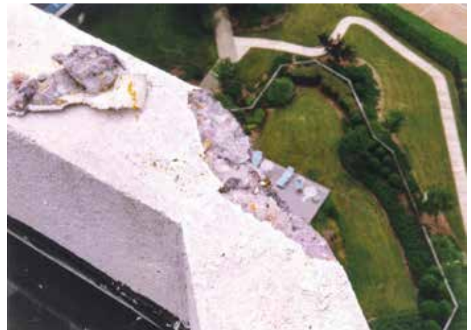
Fig. 1: Lightning frequently attaches to buildings at rooftop corners where, according to a rolling sphere analysis, the building is more vulnerable. Although the lightning strike that hit this building resulted in a small area of damage at the point of entry, the building's electrical systems were damaged and flying debris endangered people on the patio below. The building did not include a strike termination device within 24 in. (0.6 m) of the corner, as is required in nationally recognized standards for lightning protection systems

The scope of this mayhem is not widely acknowledged because individual lightning strikes seldom garner the media attention given to regional disasters; yet lightning's impact on affected businesses, communities, and infrastructure can be just as grave. The true magnitude of lightning damage is also underestimated because damage, especially to electronic components, is often misattributed.