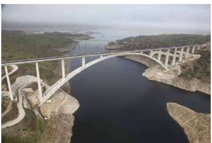
Viaduct Over River Almonte, Garrovillas de Alconétar, Cáceres