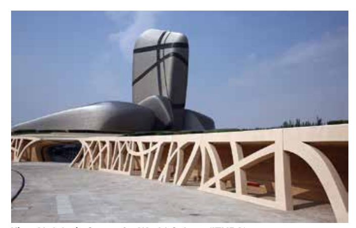
King Abdulaziz Center for World Culture (ITHRA)

"The simple, clean, and crisp contours of the different structures belie the great care, the precision, and the collaboration demanded of the entire team. From conceptualization through design and execution, the Kennedy Center Expansion Project embodies all of the qualities of excellence envisioned by the awards program," said Glenn Bell, 2020 Overall Judge.