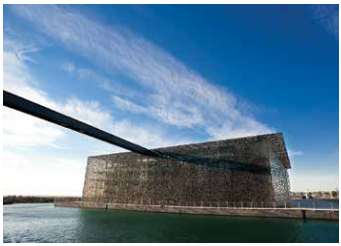
Museum of European and Mediterranean Civilizations

"Concrete was used as a main material for the structure of contemporary architecture. It is also an example of a structure not only successfully using unique materials and construction methods, but also being extremely beautiful," said Corina-Maria Aldea, 2017 Judge.