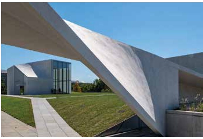
Kennedy Center Expansion Project