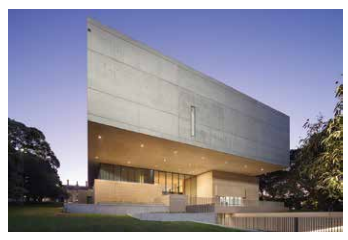
Chau Chak Wing Museum

Quay Quarter Tower, Sydney, NSW, Australia Nominated by: Concrete Institute of Australia (CIA), ACI International Partner